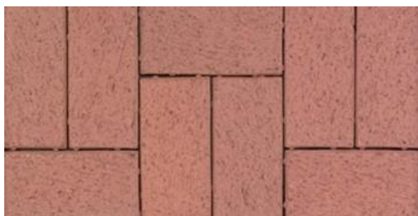
English Edge® Red 2 ¼" x 4" x 8"