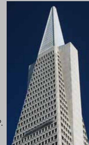
Transamerica Pyramid CA precast exposed quartz OneRestore with Cleansol BC

Personal - Always wear goggles and rubber gloves when handling OneRestore®. Refer to SDS if material is ingested, inhaled or gets on the skin or in the eyes. Read the product data sheet for details as well.