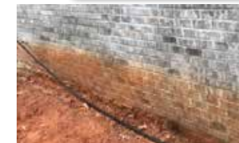
PRESSURE WASHER ONLY