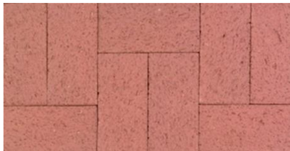
Pathway Red 2 ¼" x 4" x 8"