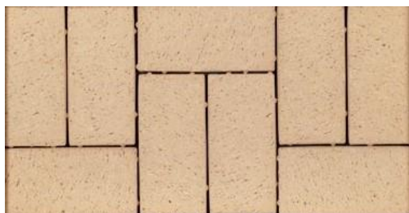
Georgian Edge Buff 2 ¼" x 4" x 8"