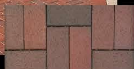
English Edge® Autumn