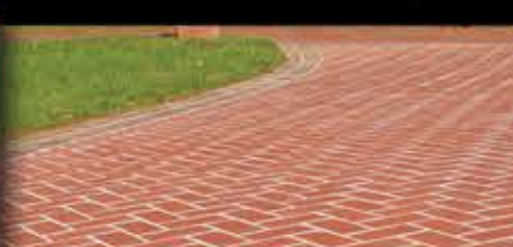
Brookstown FR 1 3/8" x 4" x 8" (Modular available)