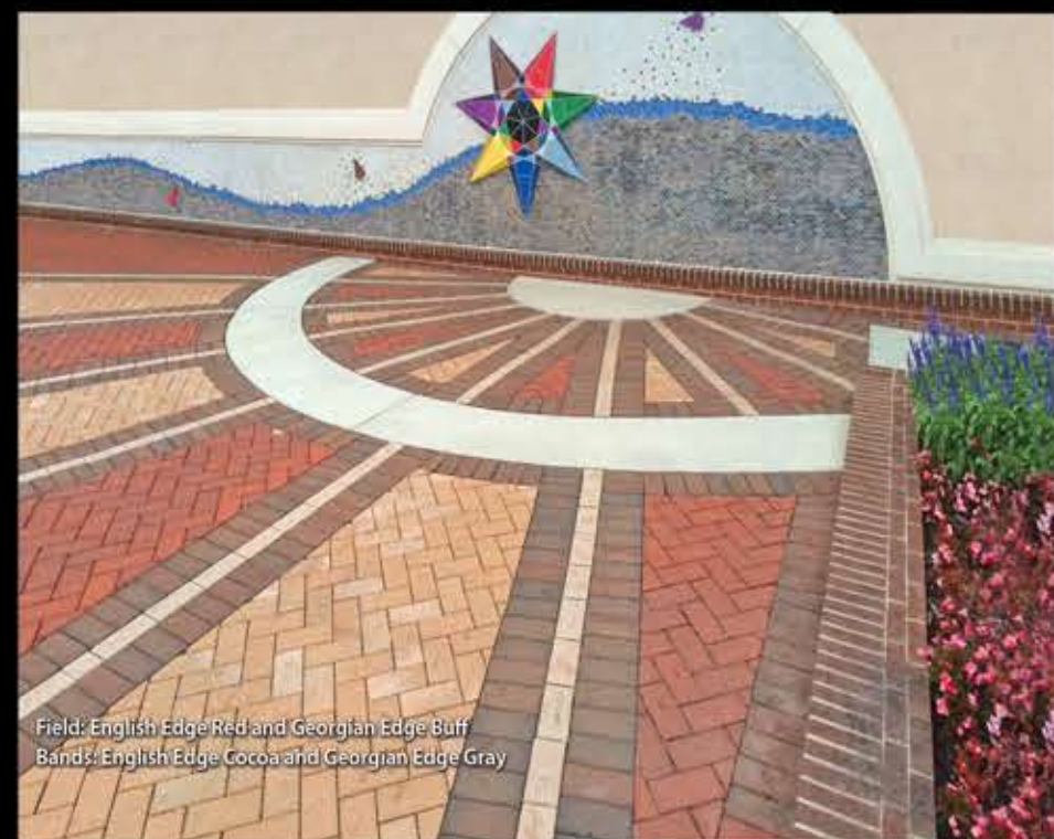
Field: English Edge Red and Georgian Edge Buff Bands: English Edge Cocoa and Georgian Edge Gray