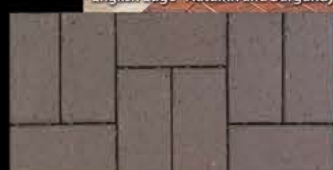
English Edge® Dark Accent