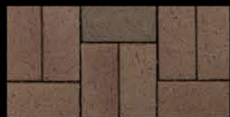
English Edge® Cocoa