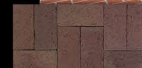
Harbourtown FR 1 3/8" x 4" x 8" (Modular available)