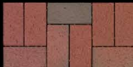
English Edge® FR