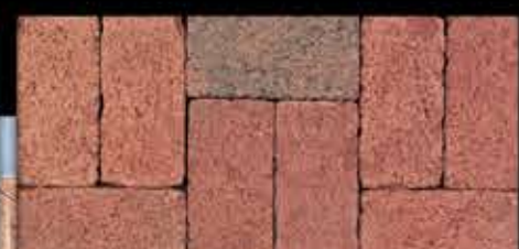
Rumbled® Full Range