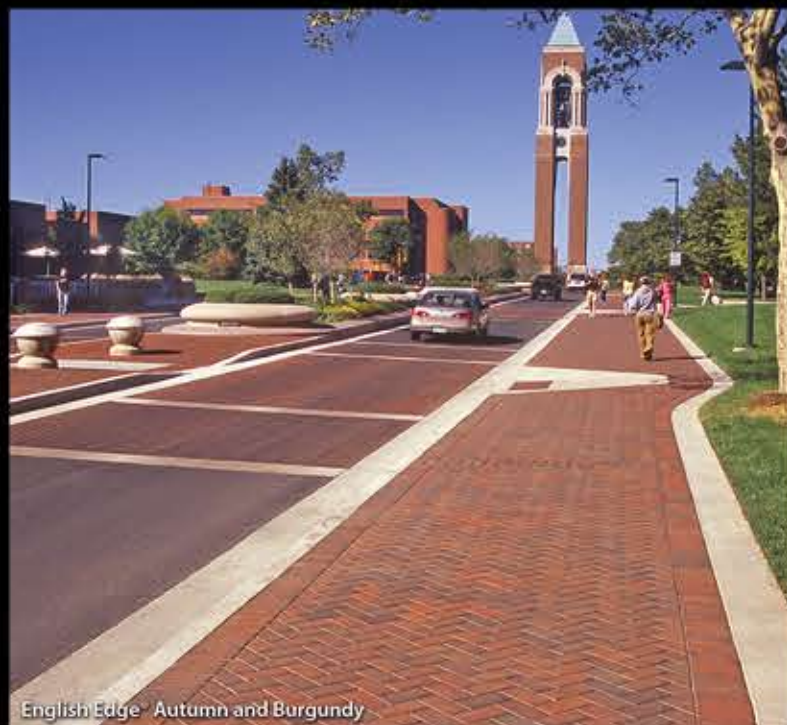
English Edge® Autumn and Burgundy

English Edge® is the original clay paver with spacer nibs and bevels on both bed surfaces. Available in 2 1/4" x 4" x 8" (2 3/4" thickness for heavy vehicular applications.)