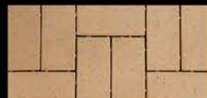
Georgian Edge Buff

Buff and Gray are available at the Fairmount, Georgia plant.