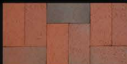
Pathway FR 2 1/4" x 4" x 8"

Also available in Rose, Dark Accent and Ironspot.