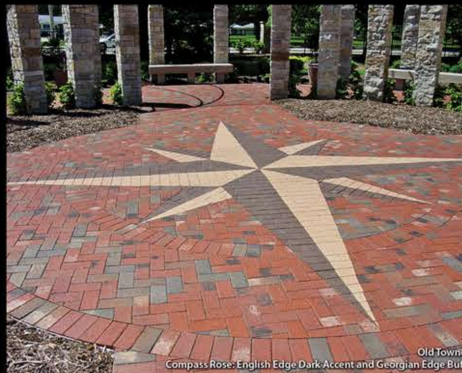
Compass Rose: English Edge Dark Accent and Georgian Edge Buff Old Towne