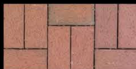
English Edge® Rose FR