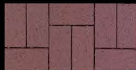
English Edge® Ironspot