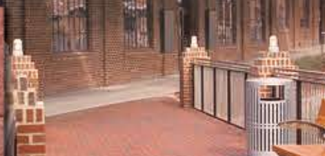
Rumbled® Full Range