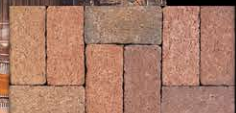
Rumbled® Rose Full Range