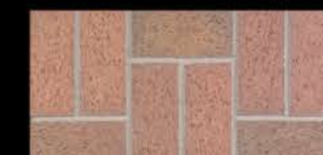
Carytown FR 1 3/8" Modular

Designed for installation over concrete. Modular size (3 5/8" x 7 5/8") intended for mortared applications (allows for 3/8" mortar joint.)