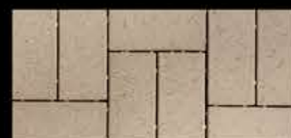
Georgian Edge Gray