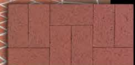
Brookstown Red 1 3/8" x 4" x 8" (Modular available)