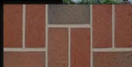
Pathway FR 2 1/4" Modular