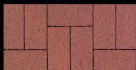
English Edge® Red