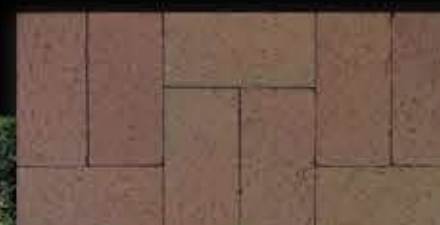
Cocoa 2 1/4" x 4" x 8" (Modular available)