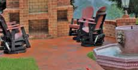
Pathway Autumn 2 1/4" x 4" x 8"