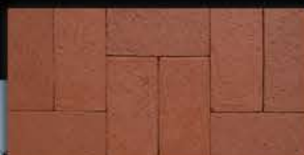
Pathway Red 2 1/4" x 4" x 8" (Modular available)