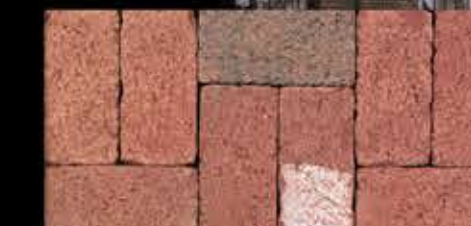
Rumbled® Main Street